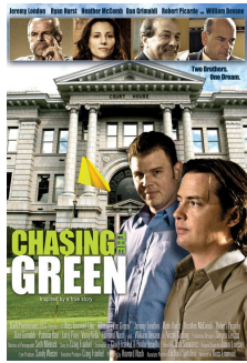
see Chasing the Green (2009)

trailer here: http://www.youtube.com/watch?v=g5qE9DsQ_Ts