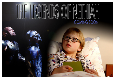
The Legend of Nethiah